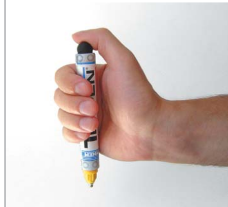
Application: Colour is pressurized