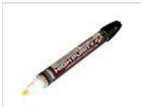
High Purity 44