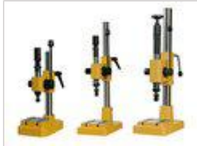
PERCUSSION PRESSES, manual