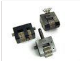
MACHINE STAMPING UNIT