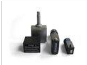
MACHINE TYPE HOLDER for individual steel types