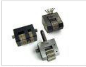
MACHINE STAMPING UNIT