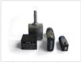
MACHINE TYPE HOLDER for individual steel types