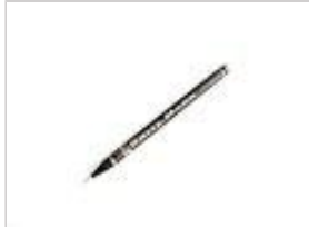
BRITE- MARK® 33